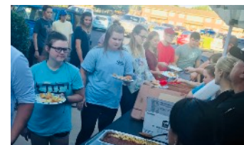
FISH FRY A FISH-FRYIN', GOOD-TIMIN' FALL BLITZ CLASSIC