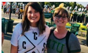
FAMILY DAY TAILGATING AT IT'S FAMILY-FINEST