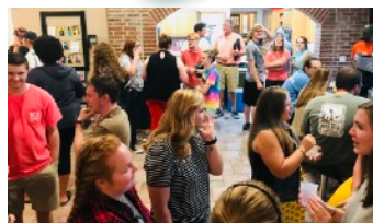
MIDWEEK WORSHIP, BIBLE STUDY, COMMUNITY