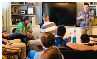
BIBLE STUDY SUNDAY MORNINGS AT THE GREER'S